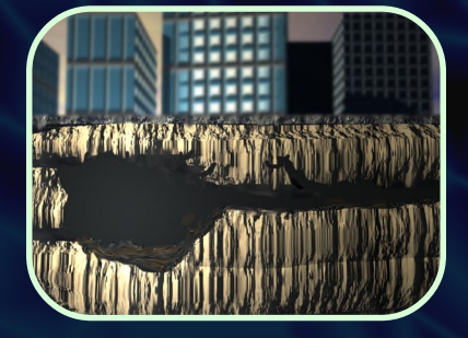
After destroying a city, you may move your monster one space, if your movement allows. You will not destroy anything in that space.