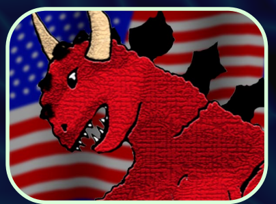
When you are challenged, and your health is lower than your opponent's, discard this card for 1d health and 1 free infamy!