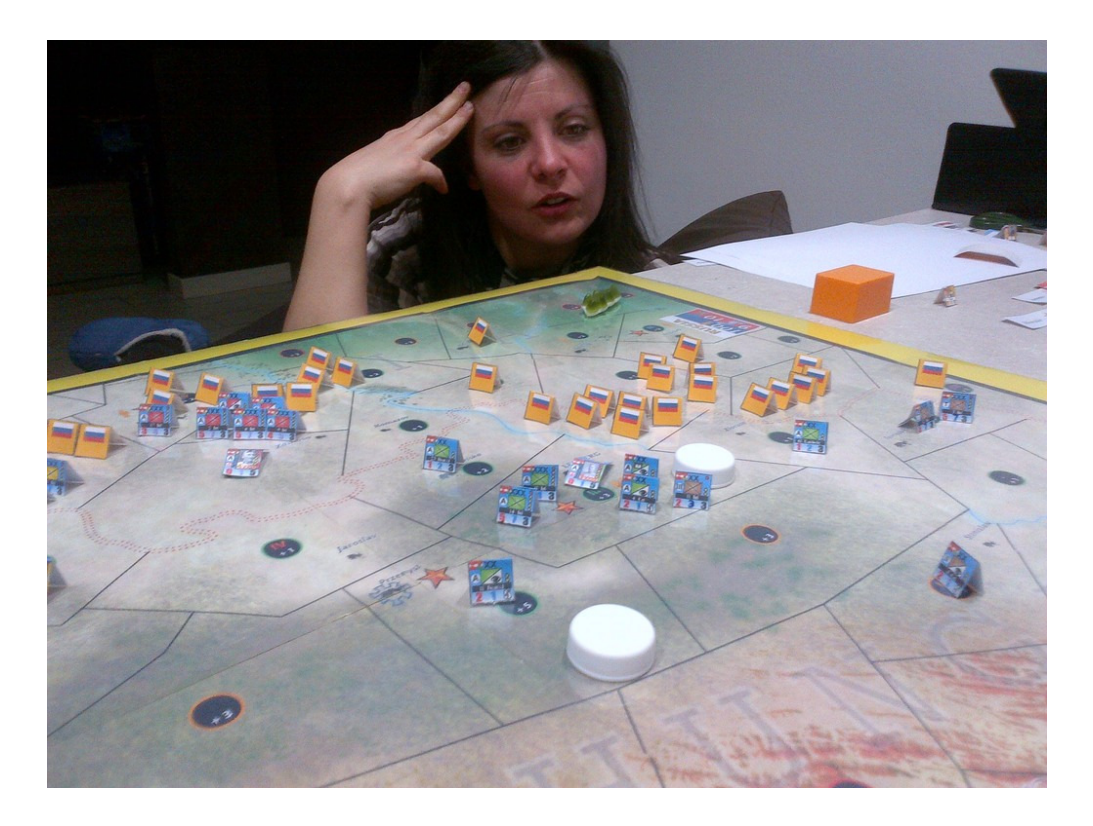
Excellent management of troop's morale, army combat experience and resources is crucial to achieving victory.