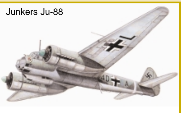
The Ju88 represented the Luftwaffe's next generation of twin-engine bombers. It was faster and had a better range than the other medium bombers, and it could out-dive British fighters to escape. The crew was grouped forward as in the Do17. Only two Gruppen of Ju88s were in Luftflotte 2 on Eagle Day. Two more Gruppen were transferred from Luftflotte 5 (Denmark) in early September.

2:10pm: Drake drops to Angels 15 and flies 20 kilometers south (F5) while the Germans line up and bomb Rye causing 2 points of damage. The raid is flying higher than reported with 1 Me109, 1 He111,